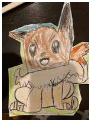
Creative Cartoons by Beckham

Did you just create an amazing piece of art? Whether you colored it, glued it, cut it, or even baked it, send us a photo with your name and we will print as many as we can. Let's make our world a bit more beautiful with your creations and smiles! Email me at: jcorey@bestversionmedia.com