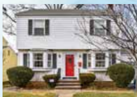
37 Aldon Terrace Bloomfield