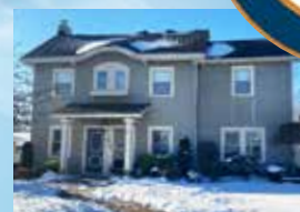
59 Mountainview Ave. Nutley