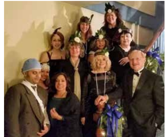
Members of the historic Kingsland Manor pose in period costumes after having a roaring good time at a special event commemorating the 100th anniversary of Prohibition (above).