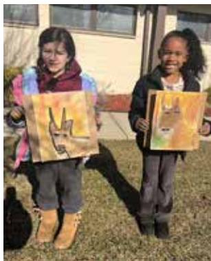
Amazing animal art