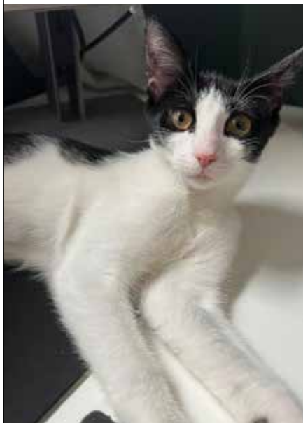
Submitted by Christa Milici, Yellow Brick Road Rescue NJ

Gia is an 11-month female who loves to purr and play! She is cat and kid friendly and still young enough to adjust to dogs. She loves to be right next to her person. She is microchipped, FIV/ FeLV negative, stool tested, dewormed, UTD on vaccines, and spayed. $150 adoption fee and application apply. ■