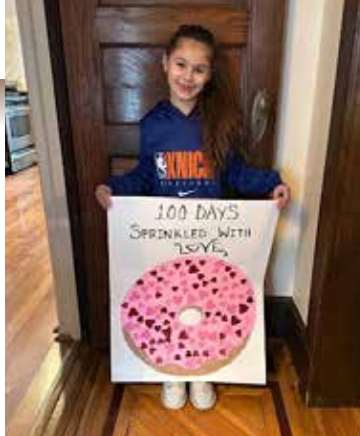
Sprinkled with love