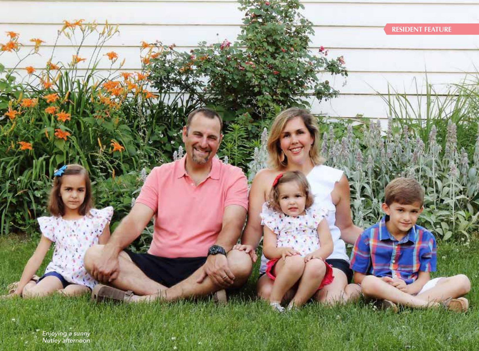
Enjoying a sunny Nutley afternoon