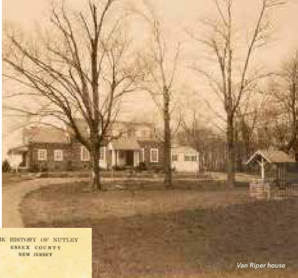
Van Riper house

a vivid description of our town that is still relevant today.