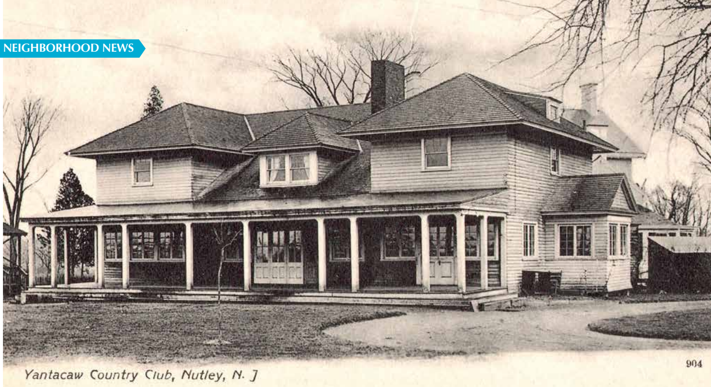
Yantacaw Country Club, Nutley, N. J