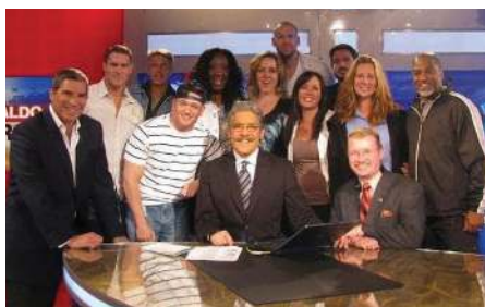
On set with Geraldo Rivera on his weekend show Geraldo At Large .

"Our logic has always been that we have our children at