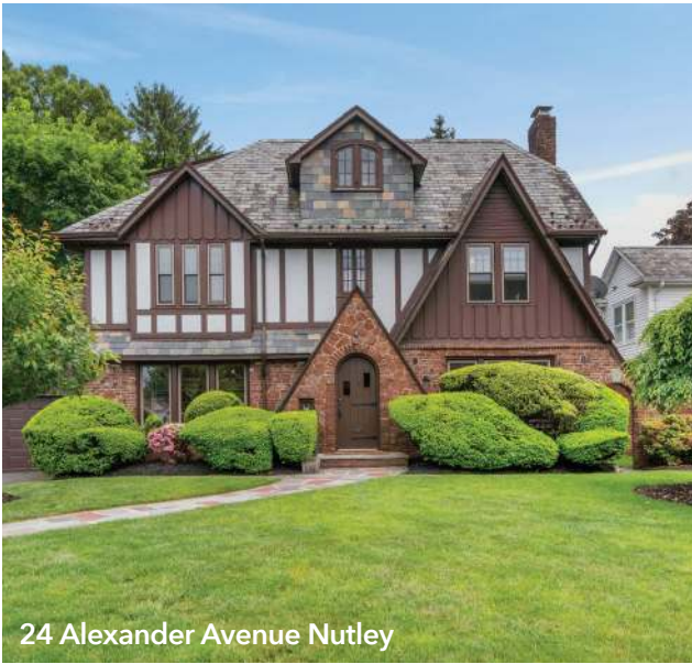
24 Alexander Avenue Nutley