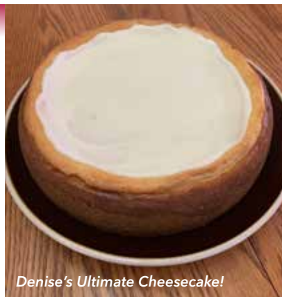
Denise's Ultimate Cheesecake!

"The crust is made with 1 ½ cups of graham cracker