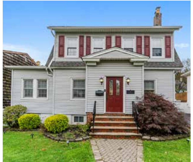
Featured Listing: Wayne Place $609,900

Best Version Media does not guarantee the accuracy of the statistical data on this page. The data does not represent the listings of any one agent or agency but represents the activity of the real estate community in the area. Any real estate agent's ad appearing in the magazine is separate from the statistical data provided which is in no way a part of their advertisement.