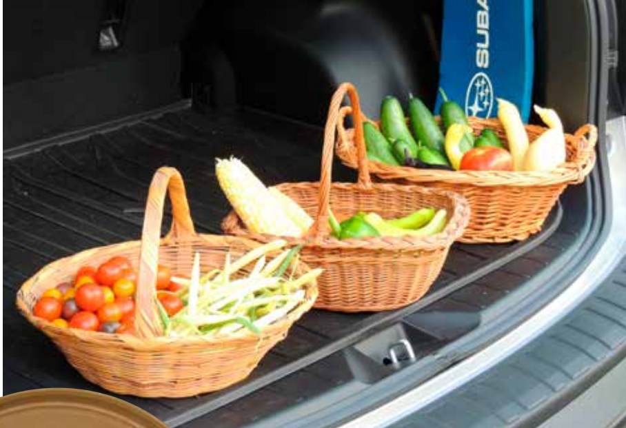
Above: The garden bounty from nature's miracle.

indicate large space needs. Next, look for weather requirements that can include planting zones, temperature extremes, moisture requirements, and days to maturity. Shorter maturity times may mean you can beat hot weather or frost to ensure plant production and allow for succession crops in that same space.