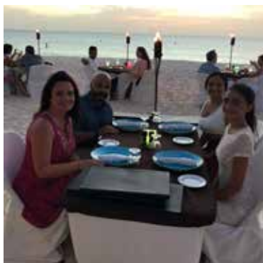
Family and love is everything. Vacationing in Aruba

Their first date came after many phone conversations but meeting in person was the official start of their relationship. "We met at Michael Angelo's Restaurant in