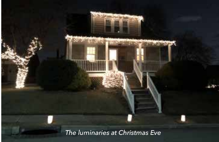
The luminaries at Christmas Eve