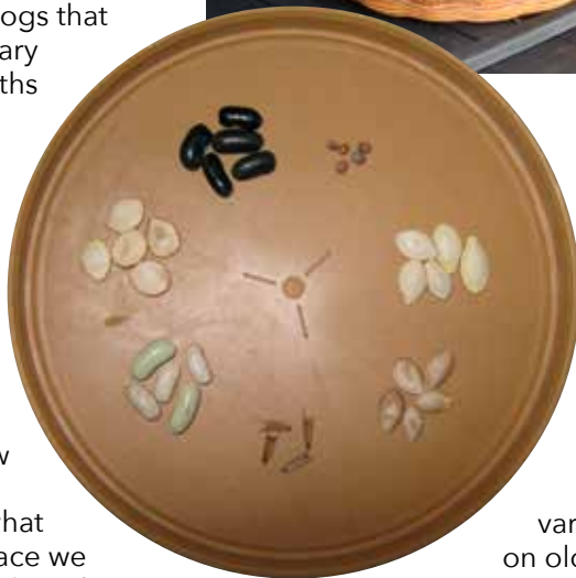
Left: Seeds come in all shapes and sizes.

The choices can be overwhelming and I am impressed that writers can describe twenty varieties of a crop, each in a different way. Start to breakdown the descriptions for space requirements. Compact or bush varieties work in small gardens, vining or plants that require support