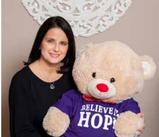
Hope lives here!

Now, let's look at the significance of the number 13 for Heather.