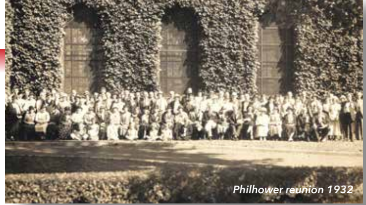
Philhower reunion 1932