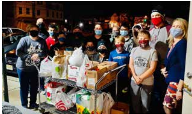
Coaches and kids helped move the food into the pantry on Friday, December 11th (above). Five cars full of donations to help stock the Nutley Family Service Bureau Food Pantry at a time when COVID-19 has caused many families to suffer (left).