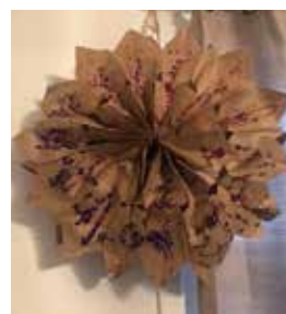
Ava's paper bag snowflake

Did you just create an amazing piece of art? Whether you colored it, glued it, cut it, or even baked it, send us a photo with your name and we will print as many as we can. Let's make our world a bit more beautiful with your creations and smiles! Email me at: jcorey@bestversionmedia.com