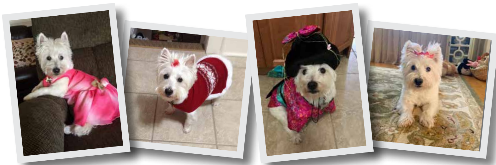
Lexi, the family dog, loves to dress up.

department at a durable medical supply company.