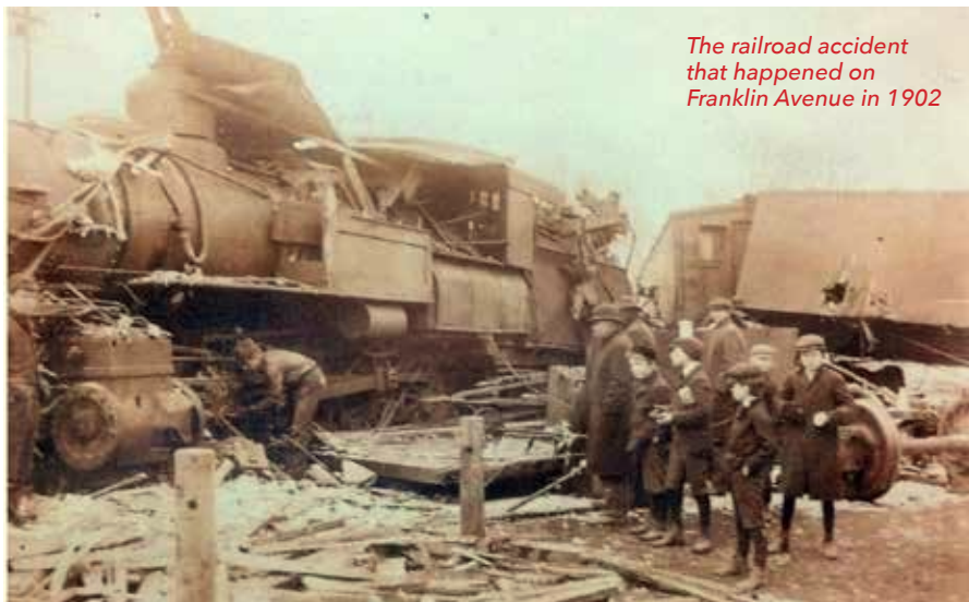
The railroad accident that happened on Franklin Avenue in 1902

The photos that survive of the crash are harrowing. It is hard to believe that they were taken right in the middle of the quiet little town we know today.