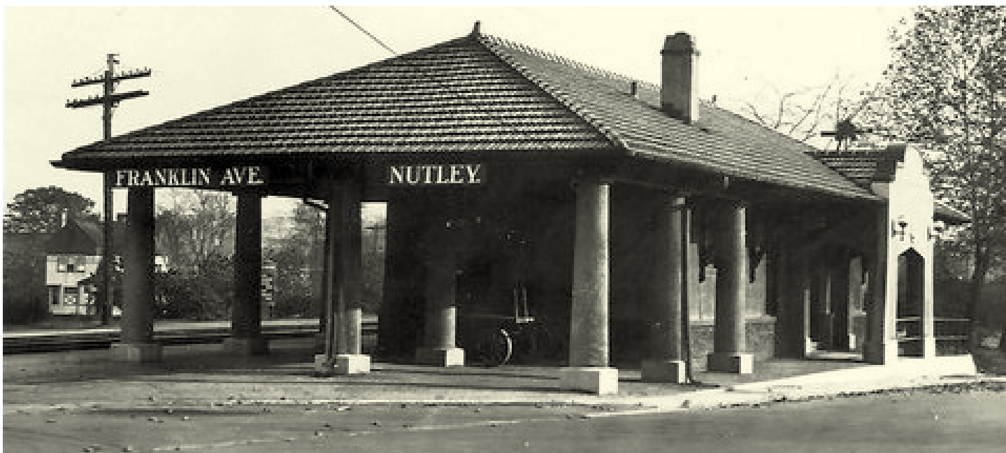
The Franklin Avenue Station in Nutley in an old photo (above)