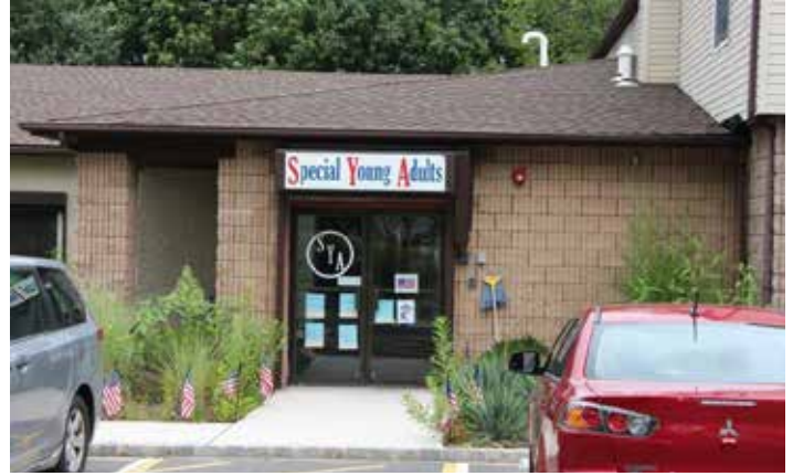
SYA building on Franklin Avenue