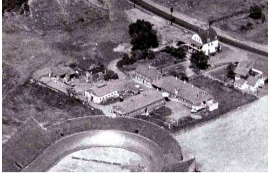
Aerial view of Nutley Dairy complex late 1930s

These Nutley Fire Department stories, while tragic, help us to appreciate the hardworking families that had businesses in town and the struggles they faced. We can further appreciate the sacrifices of our firefighters, both volunteer and career. Their time, energy, and planning helped keep families safe year-round. Factories, businesses, and the jobs within were saved numerous times. Innovations in equipment, staffing, fire prevention, and