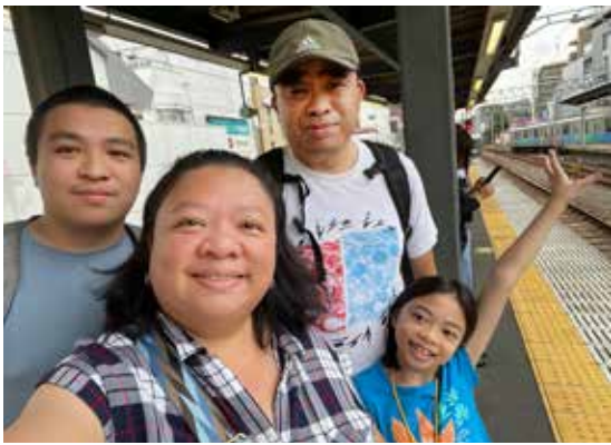
Getting around Tokyo on the Metro was an adventure!