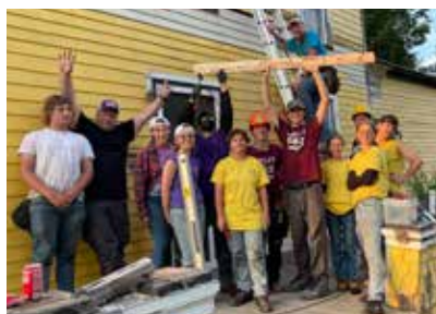
All hands on deck to finish the project!