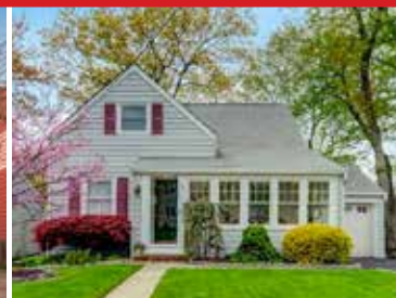
UNDER CONTRACT in 9 Days 57 Mapes Avenue, Nutley

Do you know what your home is worth in today's hot market?