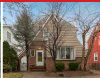
SOLD at Asking Price 44 Hay Avenue, Nutley