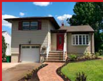
JUST LISTED 6 Van Riper Place, Nutley