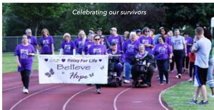
Celebrating our survivors

For more information or to get involved or to donate, visit their Facebook page: www.facebook.com/nutleyrelay