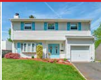
JUST LISTED 12 Sharlene Road, Nutley