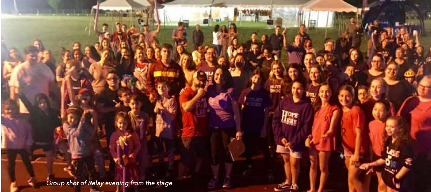
Group shot of Relay evening from the stage

listen to the birds sing along, and make this the most magical relay ever!