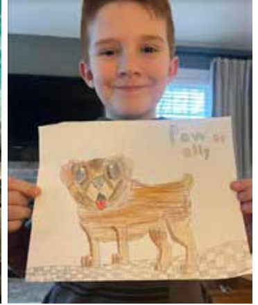
Owen's drawing of a pug

As March rolls in, we think of spring, all things green, and all the ways we are lucky. The greatest fortunes we have are the treasures that our little ones create.