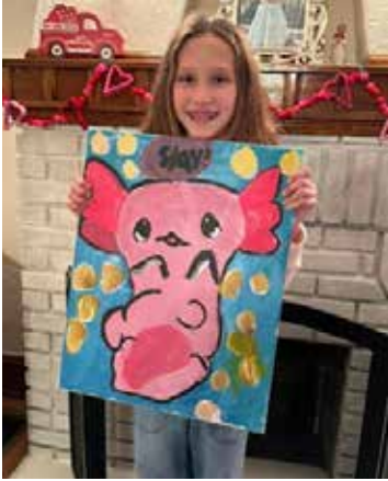
Mackenzie's amazing axolotl