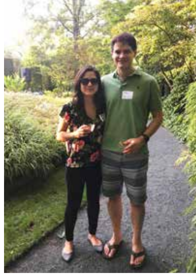
Right: At the garden party to support Nutley Family Service Bureau

Fraser family is still active in the community, the children are doing well in Nutley's schools, and they have high praise for their neighbors.