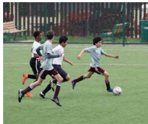
Harrison playing for Nutley United

5 The Oakley Kitchen Delicious food and live music, which is unique to the restaurants in town!