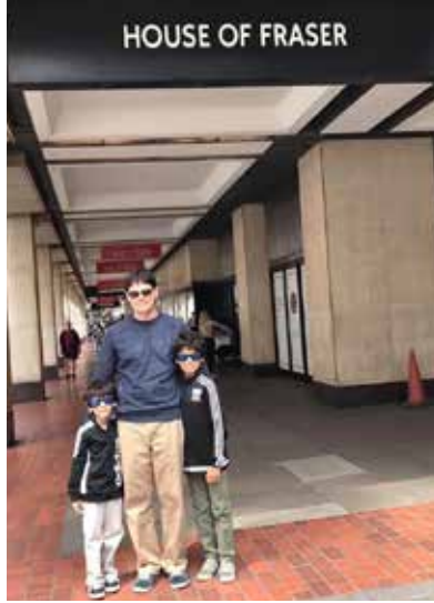
Left: At the House of Fraser in London.

Even though the family traded in one Nutley address for another, several things remained constant in their lives. The