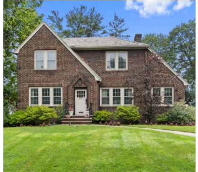
470 Passaic Ave. Under Contract, $749,999 list price

Median List Price $505,000 Median Sale Price $530,000 Median Days on Market 16