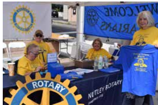
Rotary members selling t-shirts and raffle tickets.